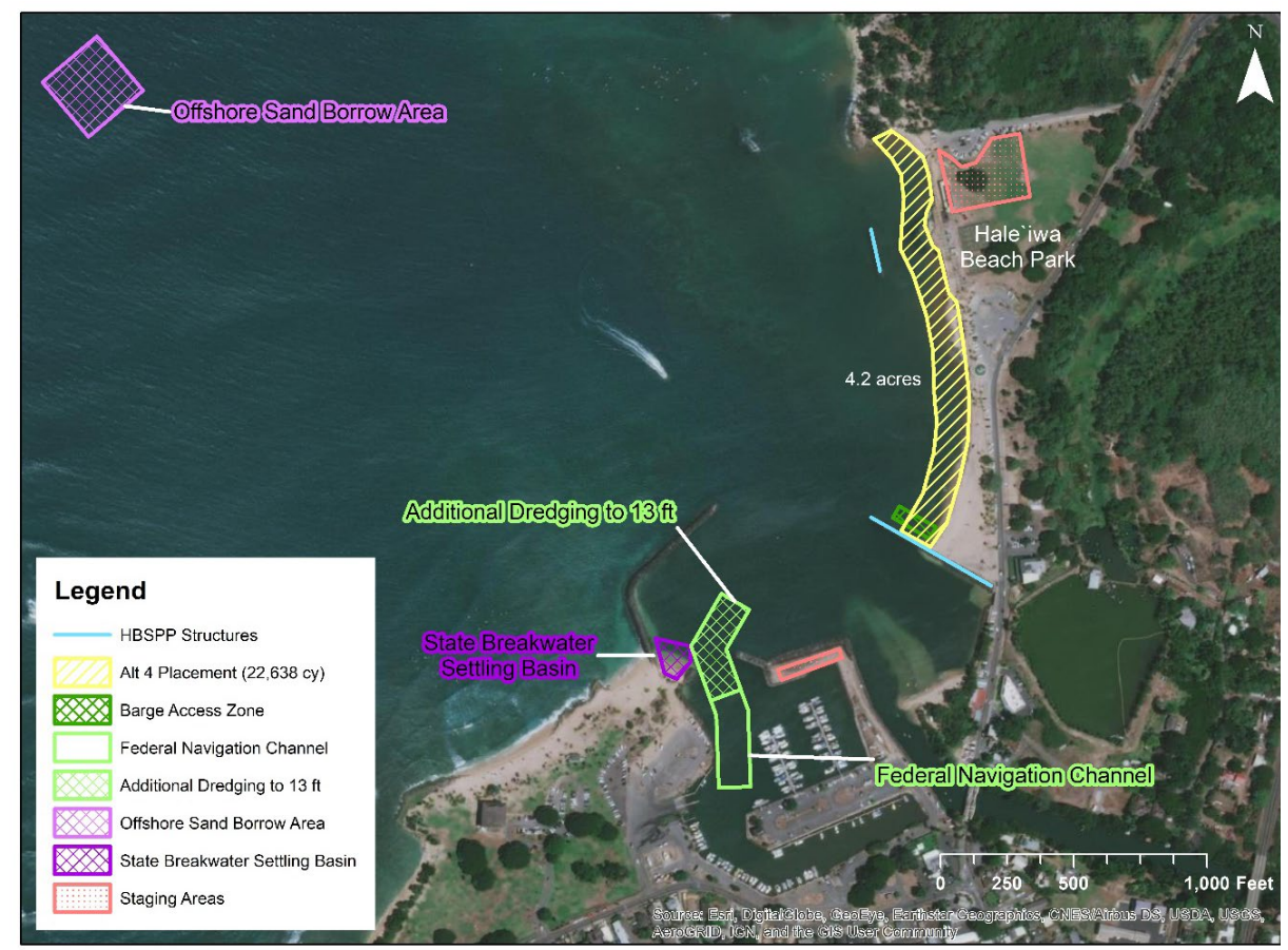
Figure 2: The Recommended Plan, Alternative 4.